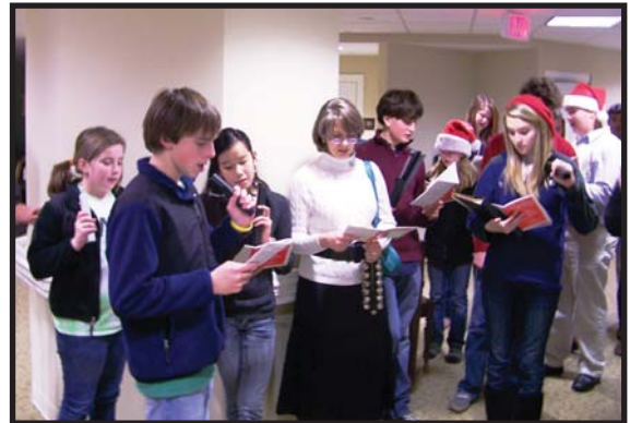
Photos of Youth Choir Caroling at SouthMinster December 19, 2010